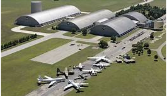
National Air Force Museum-Dayton, OH